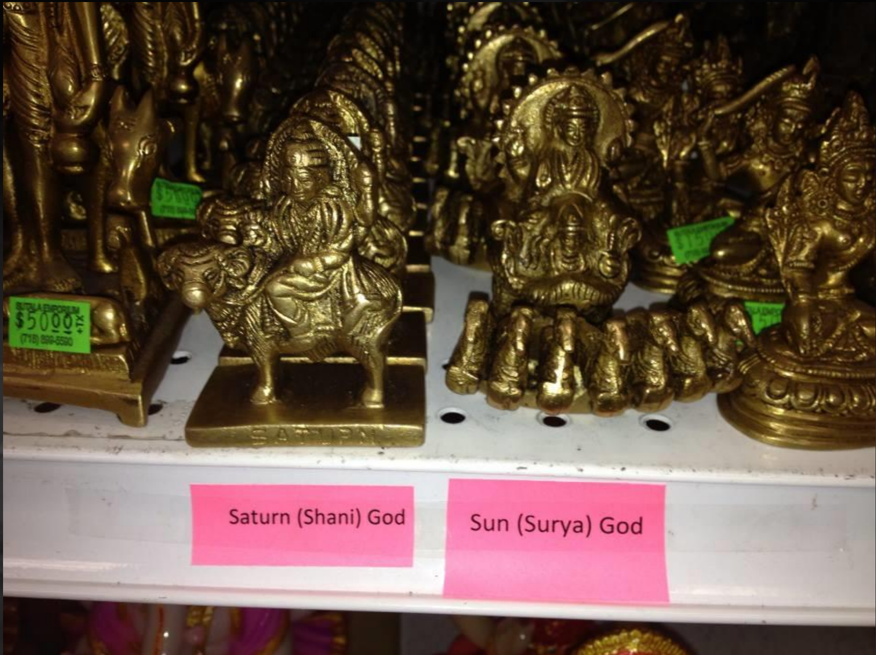
Saturn (Shani) God